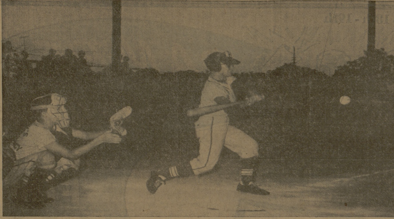
OVER THE FENCE—The pitcher for the Little League Red Sox steps into one in the game between the Red Sox and the Senators on the lighted Bryan Little League park Monday night.