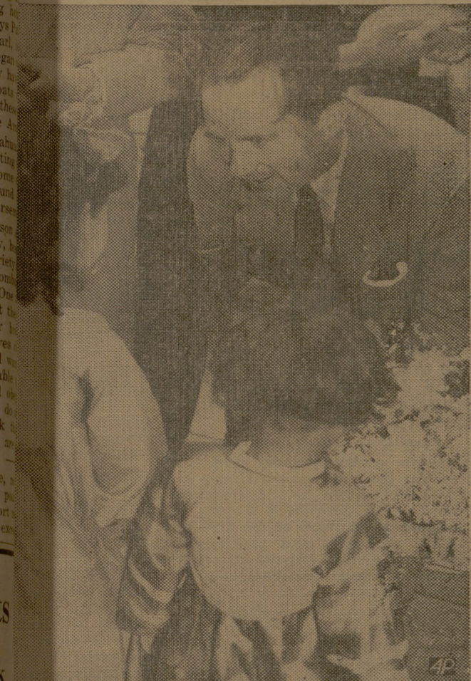
Gov. Allan Shivers chats with two of the young girls who welcomed him and Govs. Fine of Iowa and Thornton of Colorado on their trip to review of the American reconstruction program in Texas. Shivers returned to the state Sunday.