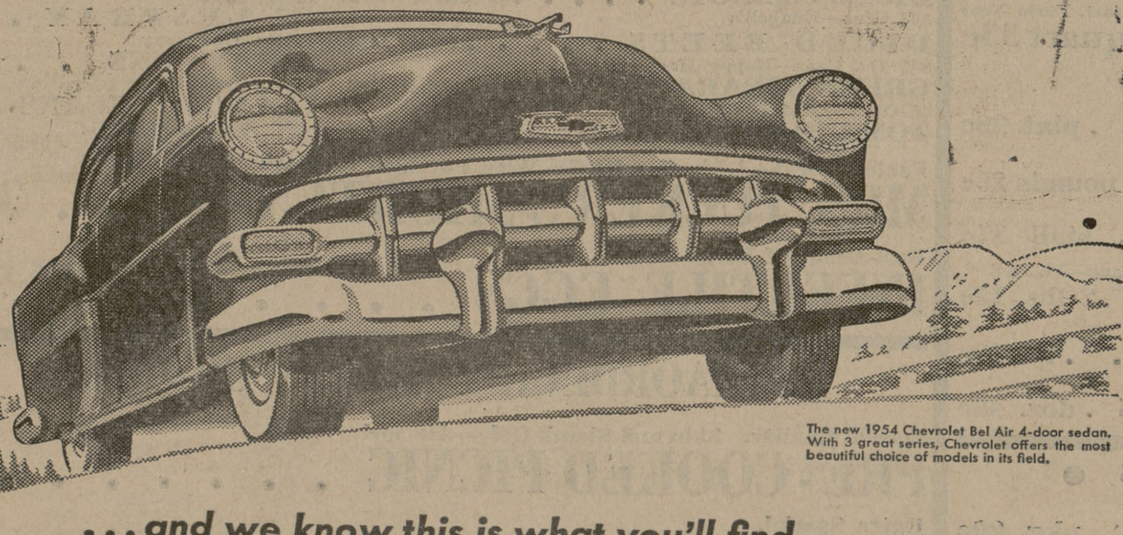
The new 1954 Chevrolet Bel Air 4-door sedan. With 3 great series, Chevrolet offers the most beautiful choice of models in its field.

... and we know this is what you'll find