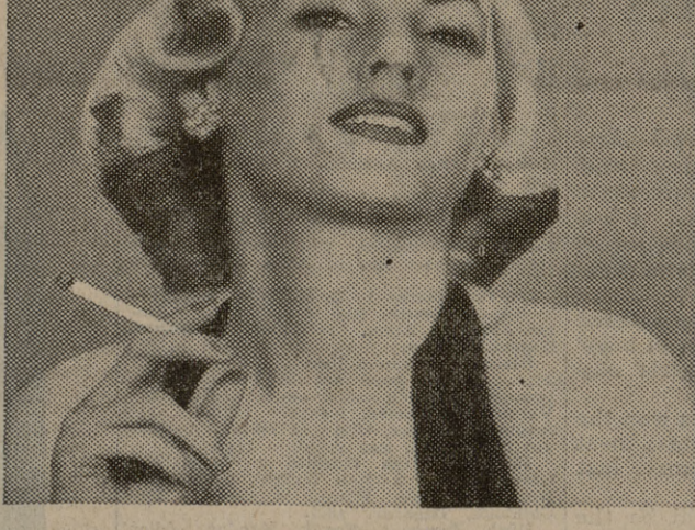
"Chesterfields for Me!" TV's Roxanne

The cigarette with a proven good record with smokers. Here is the record. Bi-monthly examinations of a group of smokers show no adverse effects to nose, throat and sinuses from smoking Chesterfield.