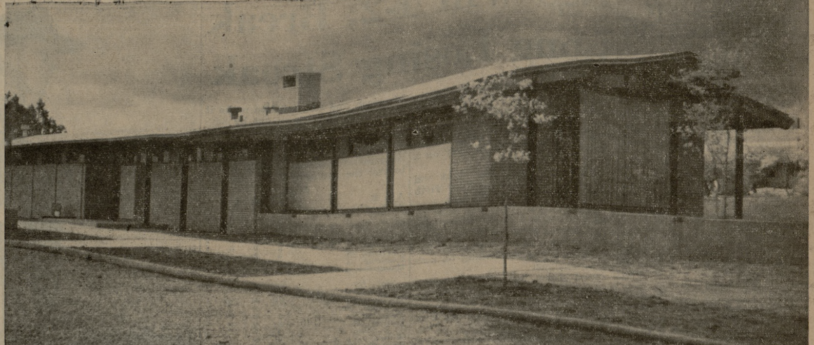
CATHOLIC STUDENT CENTER—The new student center for St. Mary's chapel will be dedicated at 2:30 p. m. followed by open house. The building includes a student lounge, a

Plans for the final party will be discussed at the meeting.