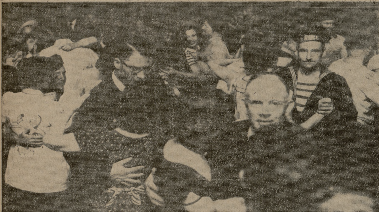
FACULTY DANCES—Faculty members dance at the French-style faculty Rue Pinale Thursday night in the Memorial Student Center.