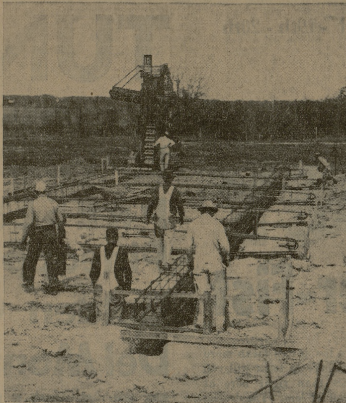
BEGINS TO SHOW —The first part of the new A&M Consolidated high school begins to show. Workmen lay foundation steel for the building, which will be located east of the present high school building. Work began Jan. 6.

• Blue line prints • Blue prints • Photostats SCOATES INDUSTRIES Phone 3-6887