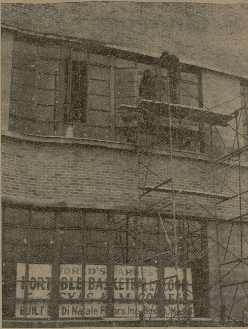
BIG SIGN; BIG GYM —This sign will be hung outside the new physical education building when the portable floor is installed. The workman is adjusting window rollers. The sign says, "World's largest portable floor for Texas A&M College. Built by Di Natale Floors, Inc."