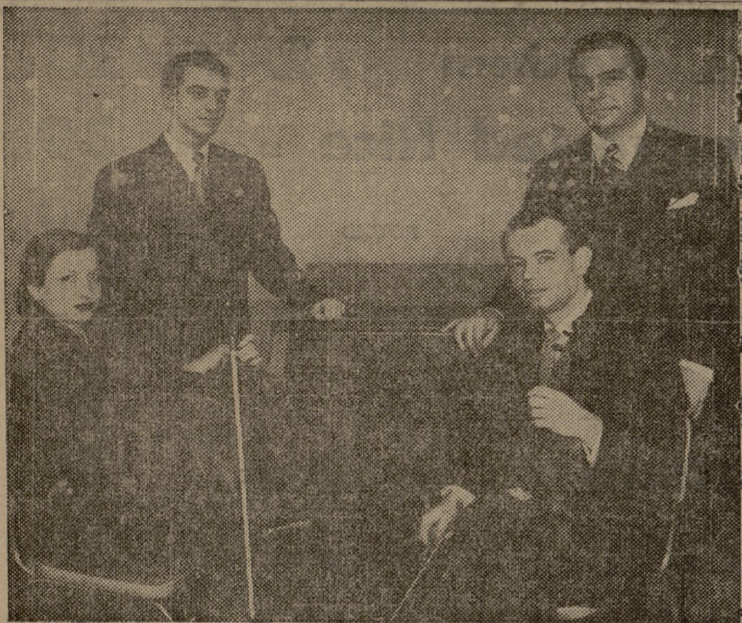
The Kell Players