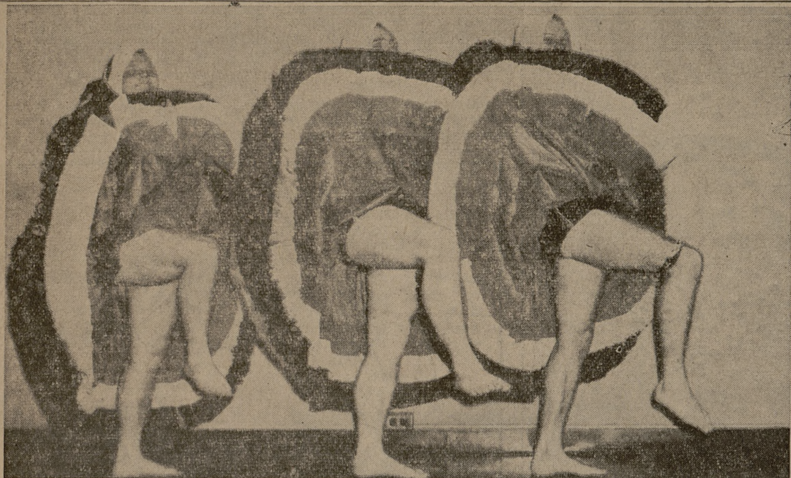
AGGIE BEAUTIES—Three members of the Aggie Can-Can line practice before tonight's Aggie Talent show. The free show will be at 7:45 p. m. in the MSC ballroom.