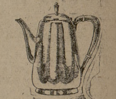
TOWN & COUNTRY, $325.