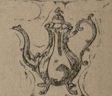
THE WINTHROP, $250.