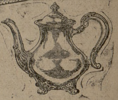
THE ROYAL, $165.

You can own Reed & Barton's beautiful Hampton Court service shown above in a matter of months the new, easy "Piece-by-Piece" way. Start by budgeting the coffee pot. Then add sugar and creamer, and so on until your set is complete. Choose from beautiful plated and sterling sets, $165.00 and up for the five pieces, Fed. tax included.