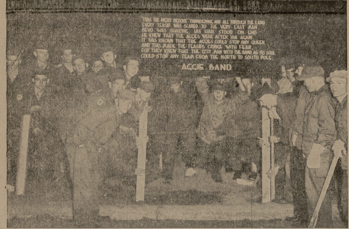
THAT'S THE SPIRIT-Maroon and white band sophomores put up their sign Sunday night on the southeast corner of drill field. The site of this picture is now covered with several other unit signs for the University of Texas game. The bands put up a combined sign for both band units.

THE BATTALION Wednesday, November 18, 1953 Page 6