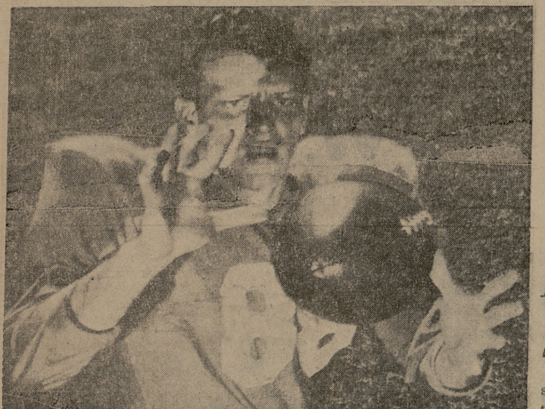
Gilmer Spring Longhorn Left End

Not only did Ellis play a good defensive game, but also returned a punt for 21 yards and 2 kickoffs for a total of 29 yards.