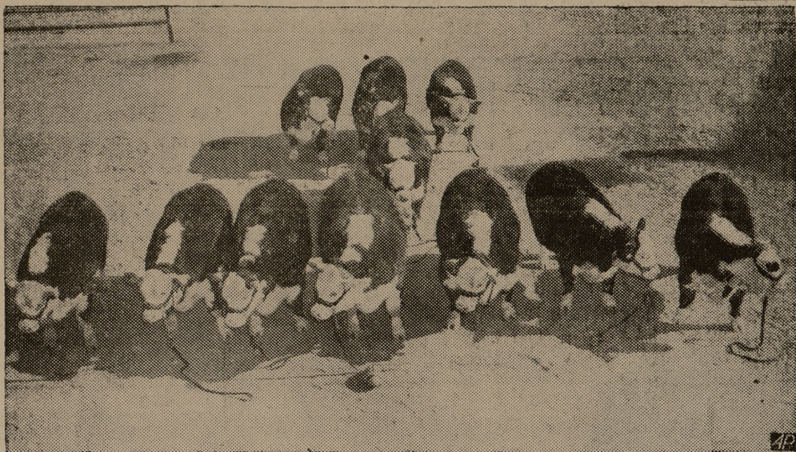
'T-BONE' FORMATION—These 11 entries in the State Fair of Texas junior steer show fall in line with the football season as they assemble in this "T" formation, complete with beefy linemen. The steers were entered by 4-H club boys from Big Spring.