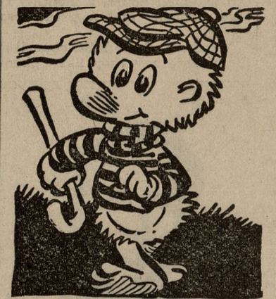
Pogo The Friendly Opossum

Kelly says the friendly 'possum's features were a problem to draw. An opossum's nose gives the crea-