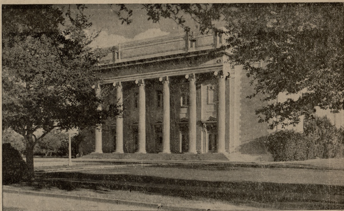
GUION HALL →