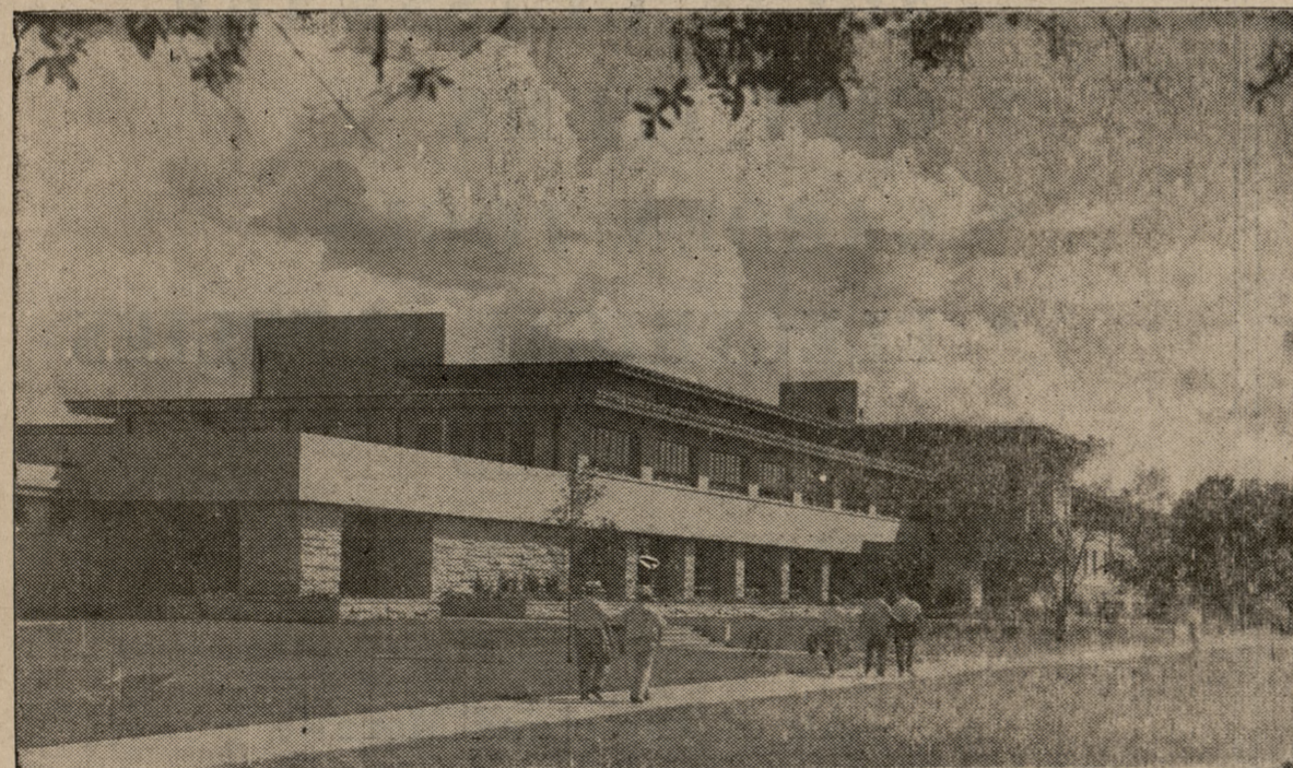
MEMORIAL STUDENT CENTER ←

The Exchange Store needs your support to make these things possible. . . . You need the support it provides. Let's work hand in hand to build of A & M a better place to live, work, study and play.