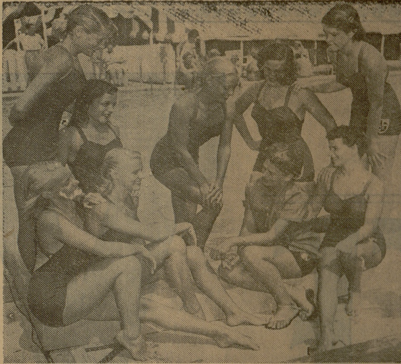
HERE TO SWIM—Some of the members of the Houston Caskettes discuss procedures in synchronized swimming.