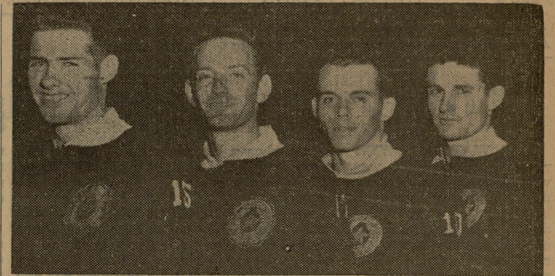
POSTS FAST TIME—Running together for the first time this year, the mile relay team pictured above turned in a good time of 3:20.6...

The Aggies have won five and lost two this year.