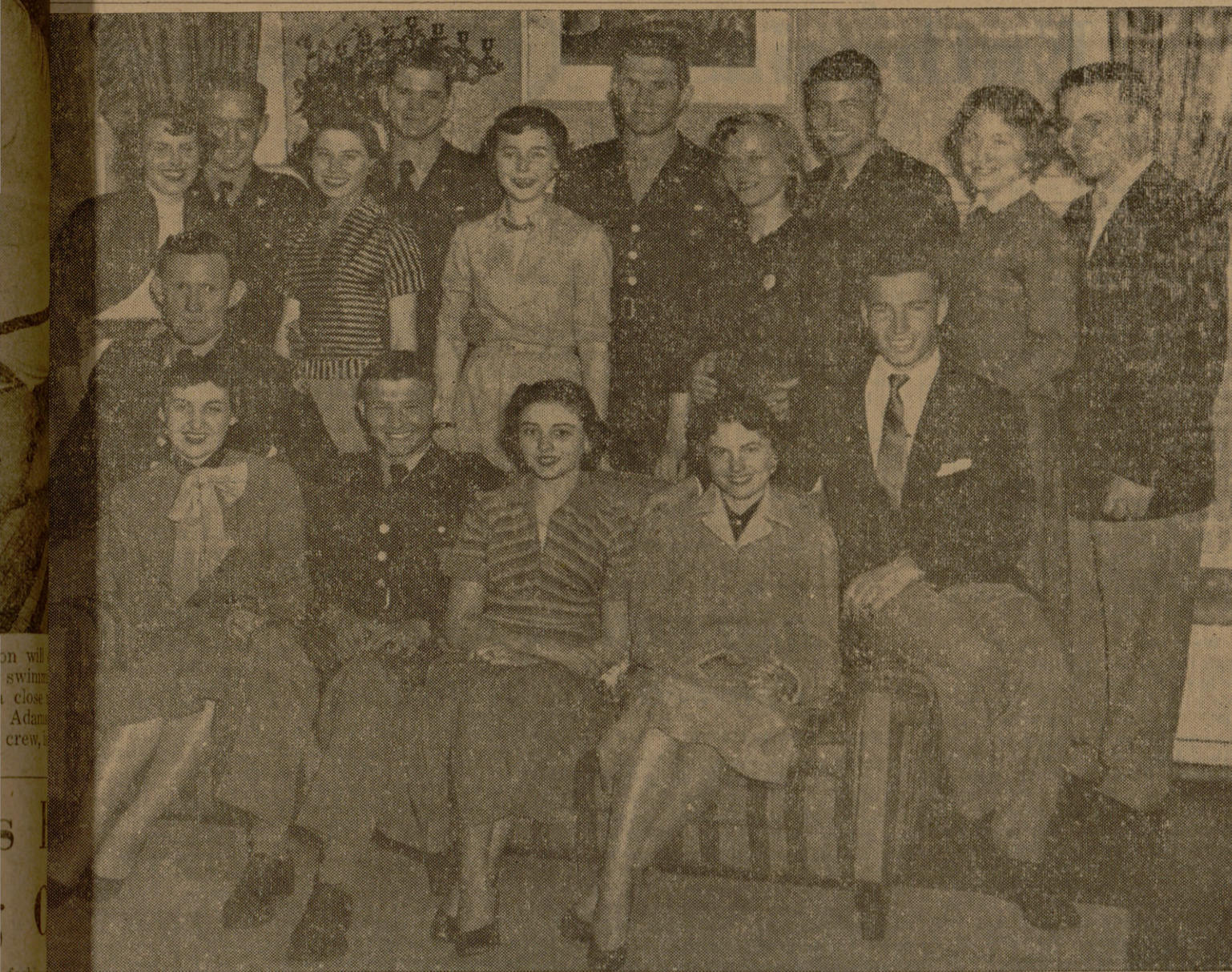
Cotton Pageant and Ball Royal Court