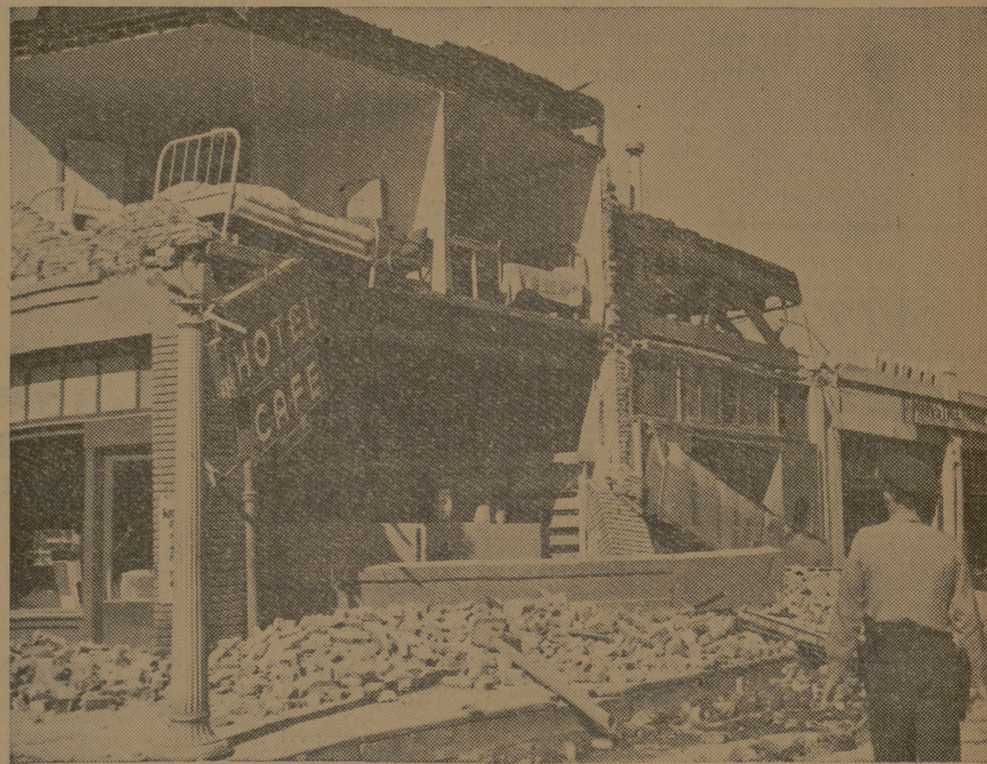
Street scene in Tehachapi after last July's earthquake.

L'L ABNER Til Death Do Them Part By Al Capp