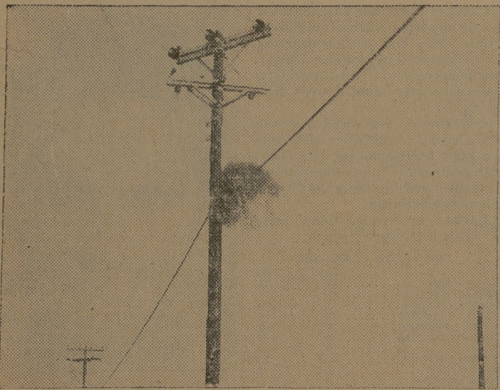
HIGH TUMBLEWEED —Winds which reached 50 miles an hour in Midland swept this giant tumbleweed to a high perch. It was carried up the guy wire and lodged on a telephone cable more than 30 feet above the ground.