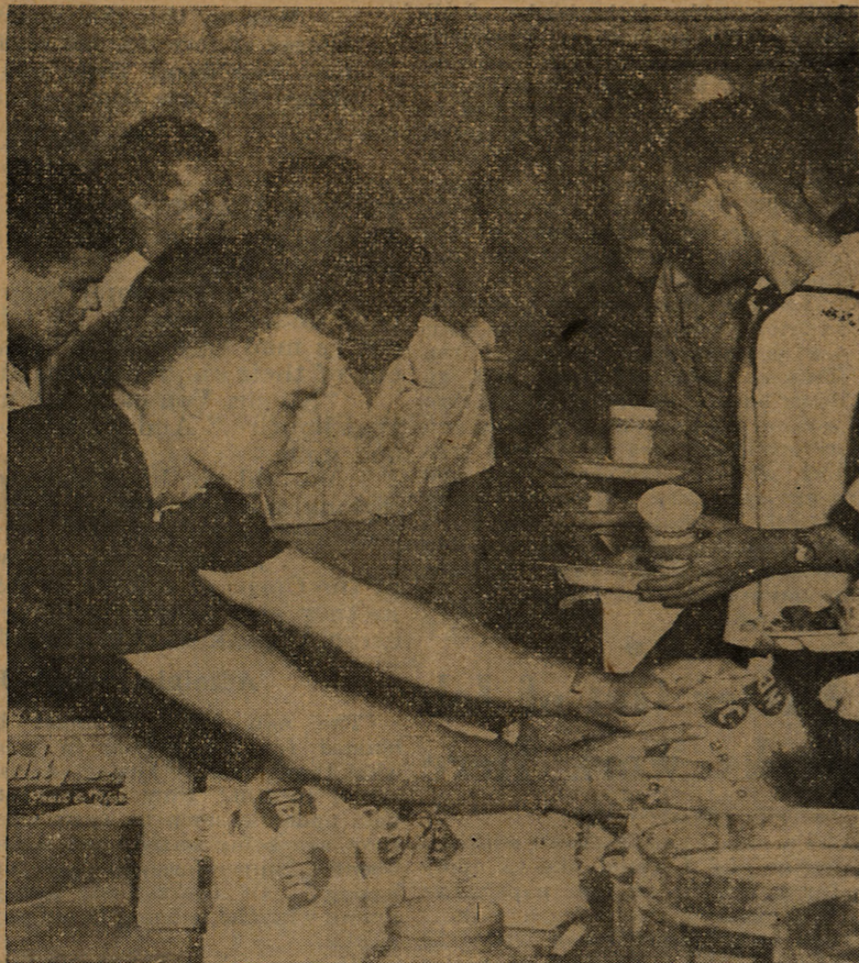
FELLOWSHIP BARBEQUE —Many Aggies attended a post-game barbecue Saturday held by the Aggie Christian Fellowship, the non-denominational church group sponsored by the YMCA.