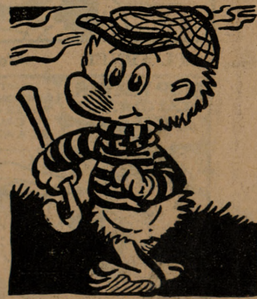
Pogo "Gig 'em Okefenokee"

Carradine has been in the following Broadway plays: "The Mad