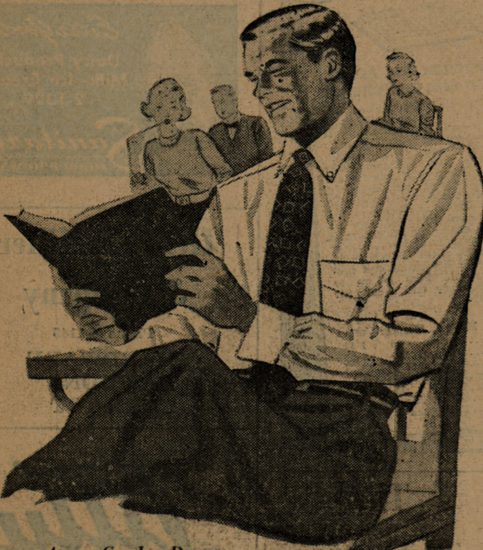
Arrow Gordon Dover: popular button-down oxford, $4.50.