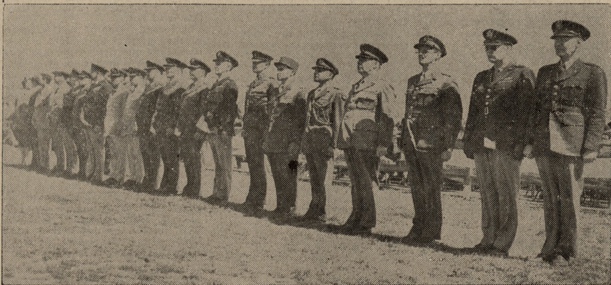
Watching the corps march by at the Annual Military Day parade are these distinguished military guests who visited the campus Friday and