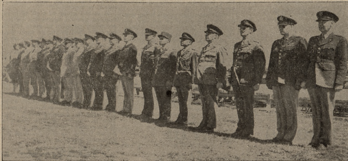
Watching the corps march by at the Annual Military Day parade are these distinguished military guests who visited the campus Friday and