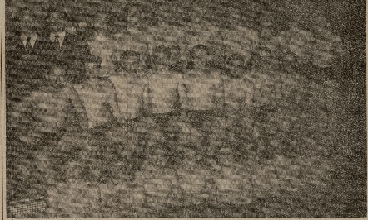
A&M SWIMMING TEAM—This 24-man strong team will represent the Aggies in the annual Southwest Conference Swimming Meet starting Thursday in P. L. Downs Natatorium. Finals will be held Friday and Saturday night. Texas and SMU are the pre-tourney favorites.

The preliminaries for the other seven events, the 100-yard backstroke, 3 meter diving, 100-yard breaststroke, 100-yard medley relay will be held Saturday afternoon with the finals scheduled for Saturday night.