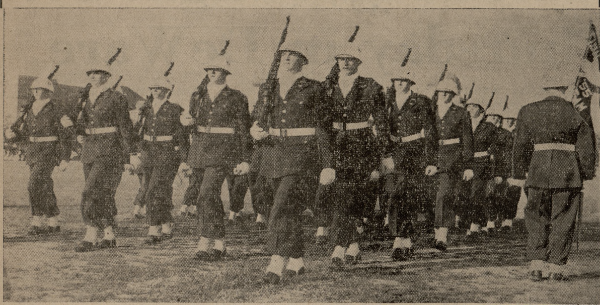
The Freshman Drill team parades before visiting dignitaries of the Danish delegation who were here to inspect A&M's ROTC facilities last Friday. The snappy drill unit also put on a perform-