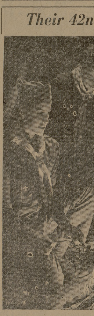
Their 42nd Birthday

By GENE STEED, Battalion Staff Writer. The Student Senate voted unanimously to allow four senators who have moved from the dormitories from which they were elected to remain in the senate as senators-at-large.