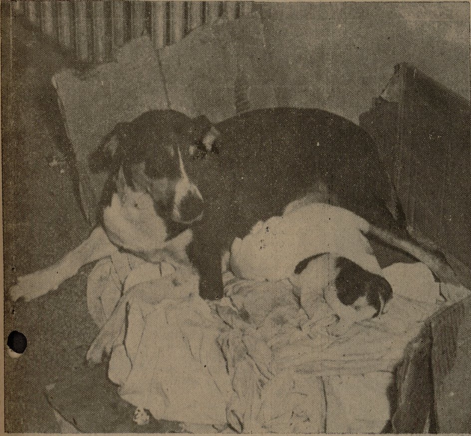
This dog of a questionable breed gave birth to her two pups in a third floor corridor of Bizzell Hall on New Year's Day. All three were evicted early this week when college authorities said there was no room for the dogs in Bizzell. They were taken to the Veterinary Medicine Hospital yesterday afternoon.