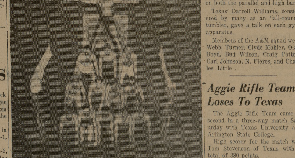
The Aggie Tumbling Team took part in the Gymnastics clinic held here Saturday, and showed the folks some of the finer stunts of the game. They are shown here as they formed a "pyramid" while preparing for the clinic.