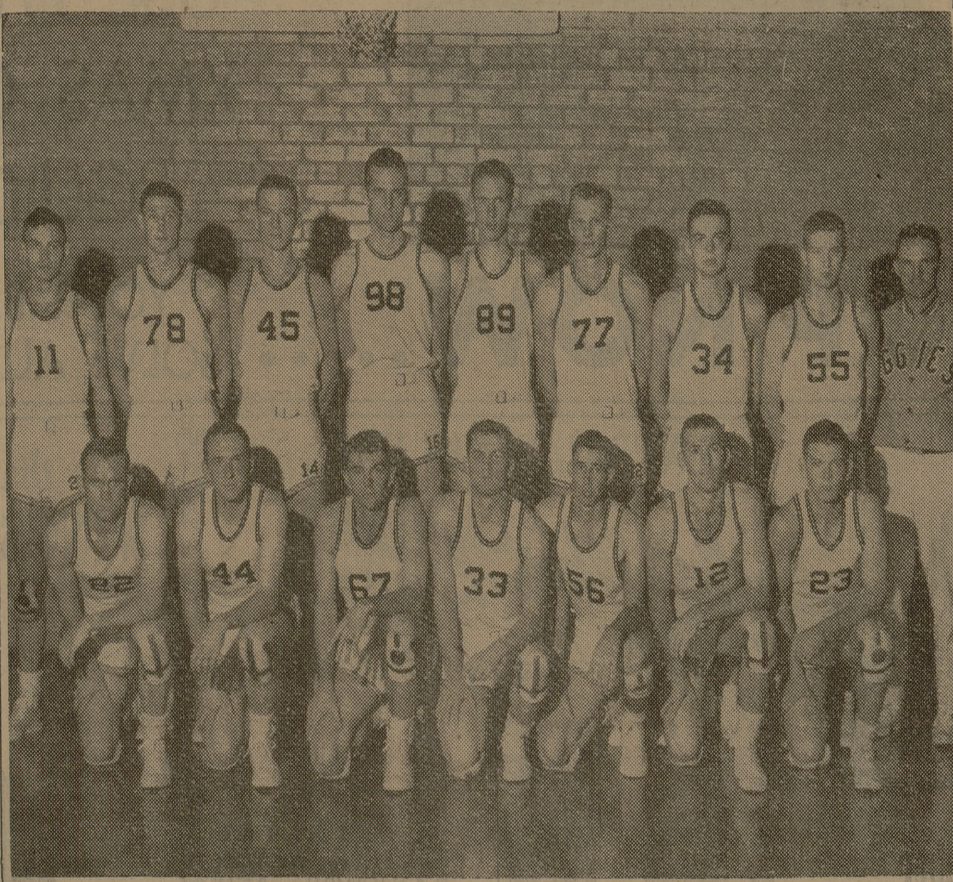
In their new game uniforms, the Aggie basketball team shows what they will look like in appearance for the 1951 season. On the home court the Cadets will wear these white uniforms but will switch to maroon when on the road. A&M also has two sets of warmups, both summer and winter weights.