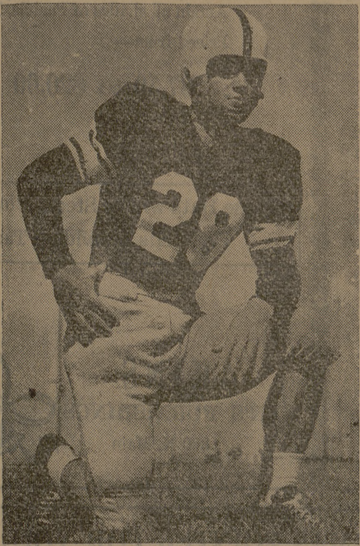
Yale Lary Left Halfback and Safety