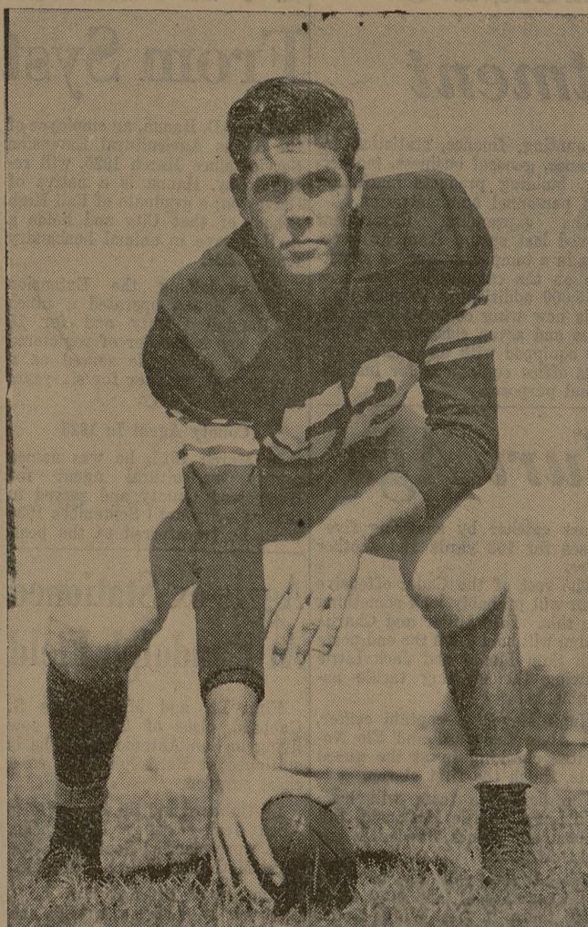
Hugh Meyer Center