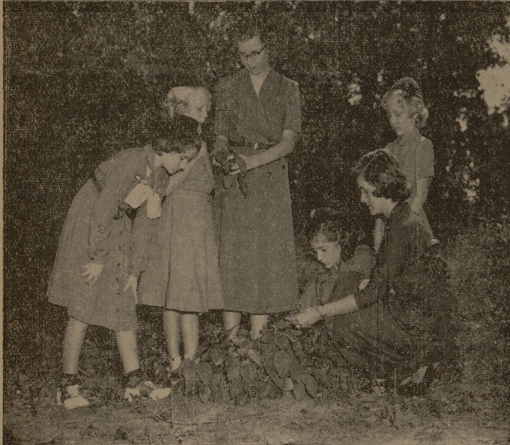
A group of Girl Scouts and Brownies study a Spanish Mulberry plant located just off the main trail in Kiwanis Park. Nature studies are one of the attractions which the park has for youngsters