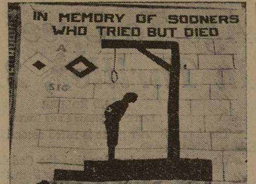
AS THEY SOWED SO SHALL THEY REAP