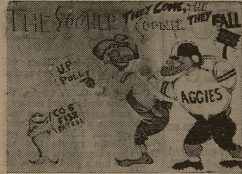
Company 6 and A Company Signal Corps were picked as winners in the sign contest for the A&M-OU football game Saturday night.

Wednesday at 7:15 p. m. the Lutheran Student Association will meet in the Lutheran Student Center.