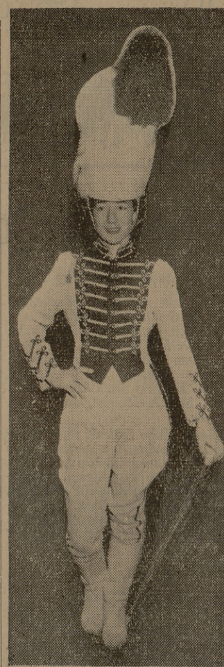
Drum majorette of the Palestine band, will head the formations of the visiting high school aggregation.

U. S. Eighth Army Headquarters, Korea, Oct. 5—(AP) Red resistance slackened today in the path of a roaring offensive by 100,000 United Nations troops on the Western front. In one place American Third Division doughboys seized a strategic hill west of Chorwon without firing a shot. The Americans had been storming the hill unsuccessfully for six days. And in the same area they beat off a series of pre-dawn counterattacks by thousands of Chinese. In an adjoining sector U. S. First Cavalry Division troops beat off waves of Chinese who attacked their positions through the early morning darkness. A U. S. briefing officer said the Third Division troops practically took their key hill for the asking. Previously the Chinese had resisted all attempts to take the peak. The briefing officer said Red opposition dwindled all along the 40-mile front. There, troops of nine United Nations three days ago launched their biggest offensive in three months. British Commonwealth forces, especially the Canadians and Australians, reported only light resistance Friday morning.