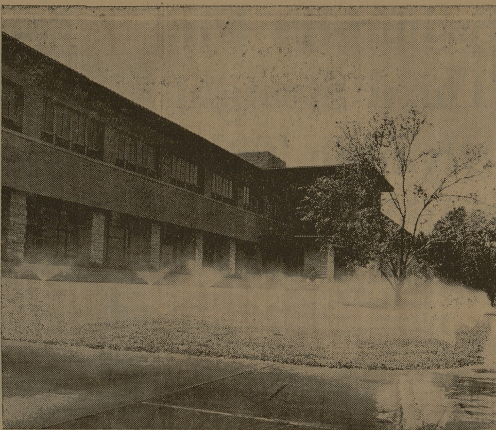
The many consecutive rain-less days have caused the MSC's sprinkling system to stay in full operation this Summer as the grass surrounding the big student center remains the greenest on the campus.