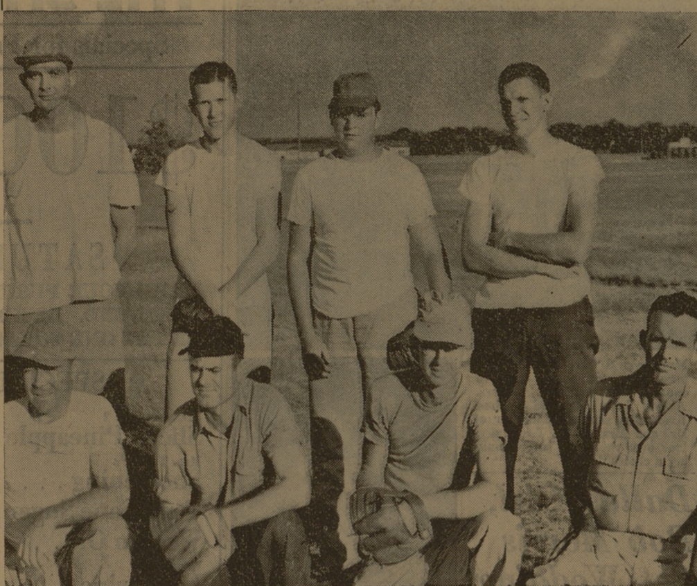
Another of the College Station Recreation Council's Summer softball teams, the Tigers are short a couple of men as they posed for this picture prior to a recent game. Front row, left to right,