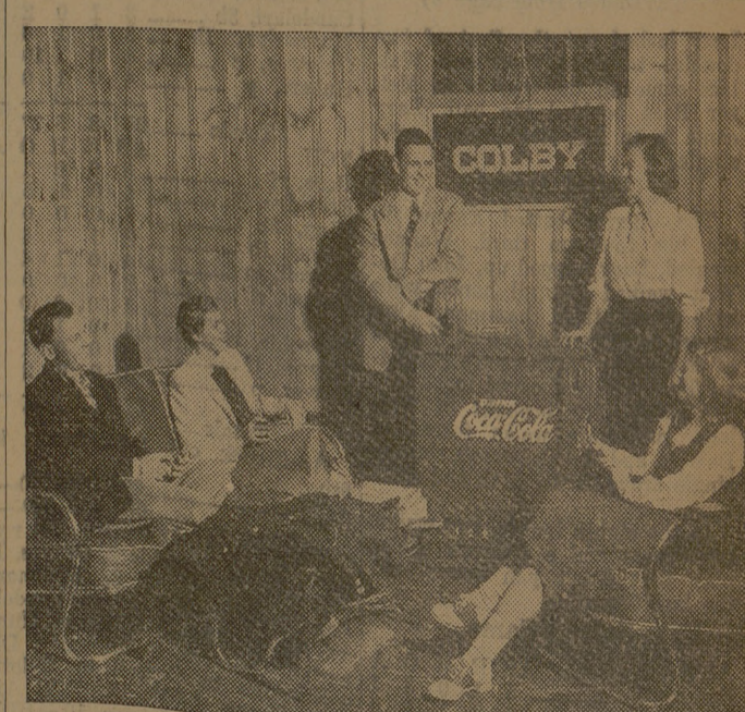
Colby Spa Colby College Waterville, Maine