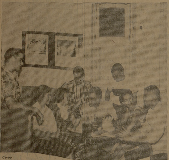
Co-op University of Arizona Tucson, Arizona