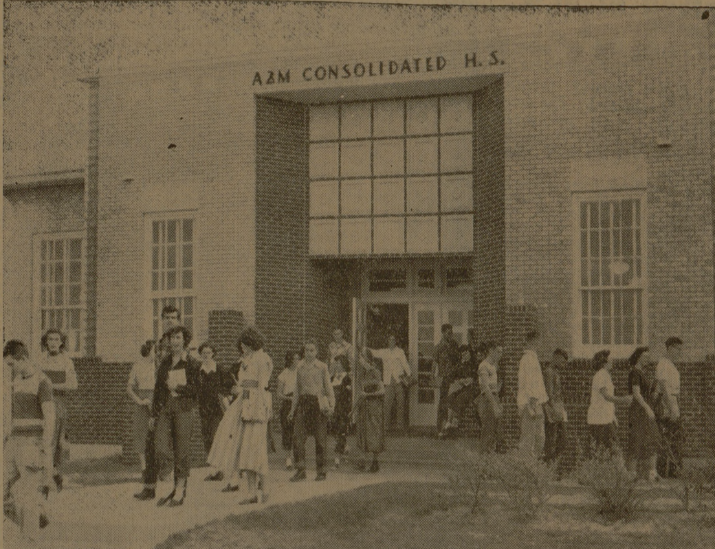
Public School Week has provided a busy time for students of College Station Schools. The six-day observance will end Saturday with a combination card, square dance party sponsored by the Campus Study Club at the Consolidated