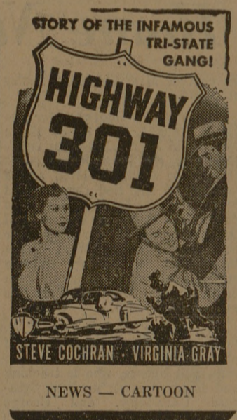
NEWS - CARTOON

TODAY thru SATURDAY FIRST RUN —Features Start— 1:23 - 3:09 - 4:42 - 6:28 8:14 - 10:00