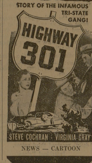
NEWS - CARTOON

TODAY thru SATURDAY FIRST RUN —Features Start— 1:23 - 3:09 - 4:42 - 6:28 8:15 - 10:00