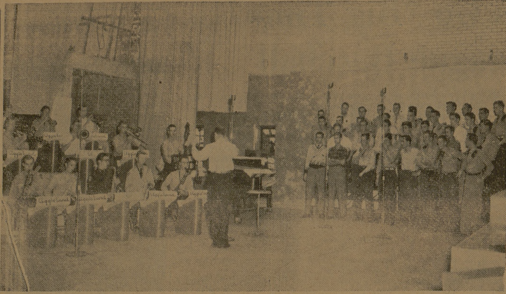
The Singing Cadets and the Aggield Orchestra swing out as they record "Songs of Texas A&M", a collection of favorite Aggie music, which will be premiered Feb. 19. The writers of the music will be on hand to autograph albums sold at the World Premiere. The Aggield also recorded for the collection.

Call For and Delivery STUDENT CO-OP Phone 4-4114