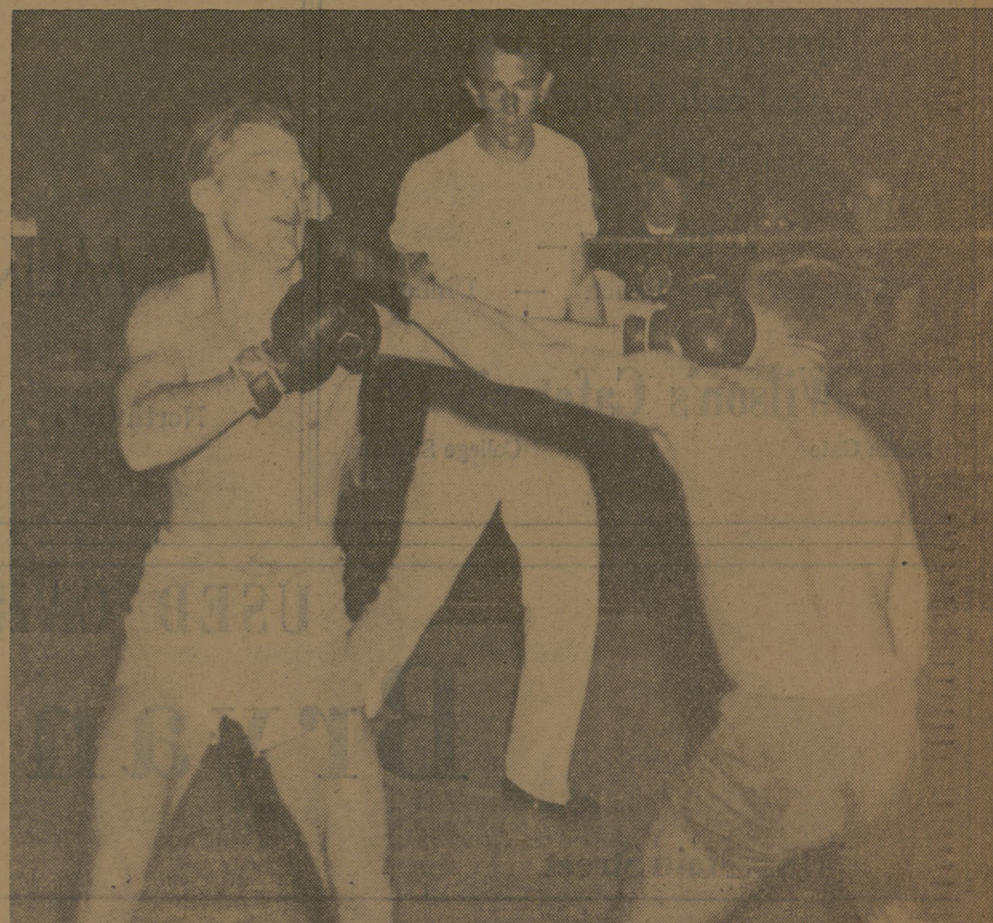
Below—Boxing, wrestling and Gymnastic equipment worth $1,000.00 was purchased from the EXCHANGE STORE profits. Shown here is some of this equipment in use.