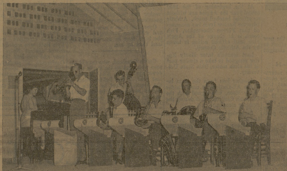
Above—two-thousand five hundred dollars worth of equipment was bought for the Music Hall from THE EXCHANGE STORE profits. Directly using this equipment were the Aggie Orchestra, Singing Cadets, and the Summer Aggie Combo shown above.