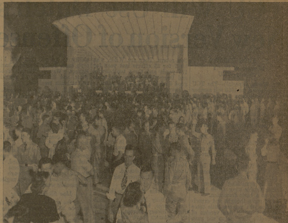
Above—The band shell at the grove was built partially from EXCHANGE STORE profits. Of the total construction cost, $5,500.00 was supplied from the EXCHANGE STORE. The grove with its new band shell was the mecca of the summer recreation program this summer.

The EXCHANGE STORE made donations totaling $155,000.00 to the new Memorial Student Union. The Memorial Student Union operating fund was enlarged by $105,000.00 from the EXCHANGE STORE profits. A total of $50,000.00 has been paid to the building fund of the Memorial Student Union by the EXCHANGE STORE.