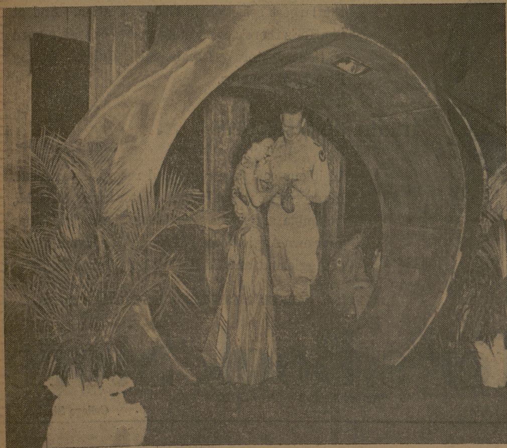
Below—a couple is walking through the senior ring at the big annual dance for Graduating seniors. The large replica of the Aggie Ring was built with EXCHANGE STORE funds.

THE EXCHANGE STORE has out the welcome mat for all returning students and for the many new students who are entering A.&M. for the first time.