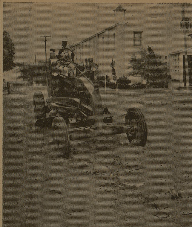
With hopes that no more drainage problems will cause people at the Church Street - Main Street intersection any more trouble, the city is currently grading and cutting down the level of the street and ditches so near flood conditions will not exist at this spot everytime a large rain falls.