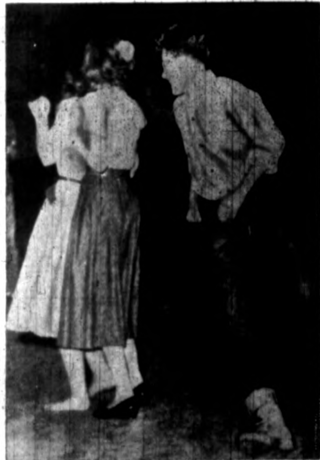
More than twenty-five young people enjoyed an evening of games and other entertainment at the weekly Teen-Age Party held on Patranella Slab last Wednesday night. One young aspirant is shown trying to find his place in a game of "two-deep."

Six Brazos County candidates will be unopposed in next month's Democratic primary as the deadline for filing fell Saturday at midnight. Only one candidate filed during the last week.