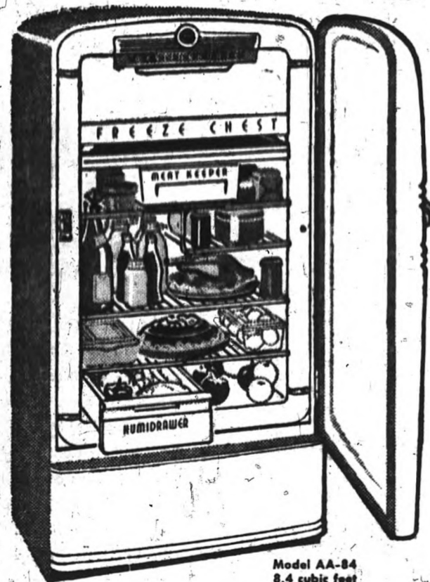
Model AA-84 8.4 cubic feet

Yes, you get loads of frozen food storage space in this big new 8.4 cubic foot model. You get this, too—Meat Keeper that keeps 16 pounds of meat fresh for days, big ¼ bushel Humidrawer for fruits and vegetables, ample capacity for other foods. Westinghouse COLDER COLD means extra fast freezing, extra safe storage.