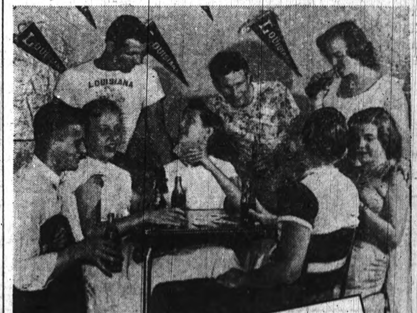
Field House University, Louisiana (Baton Rouge)

Friday was the last day for picture-making.